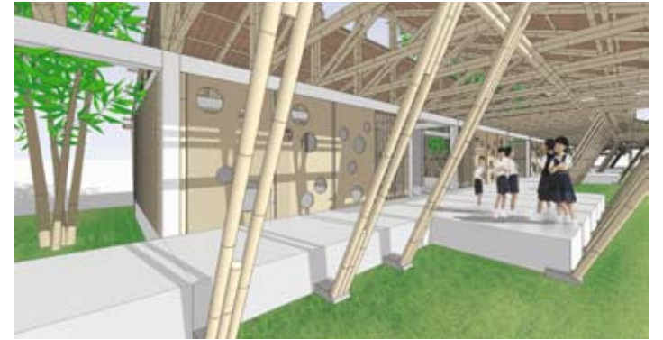
Perspective view of the veranda and walkway outside classrooms